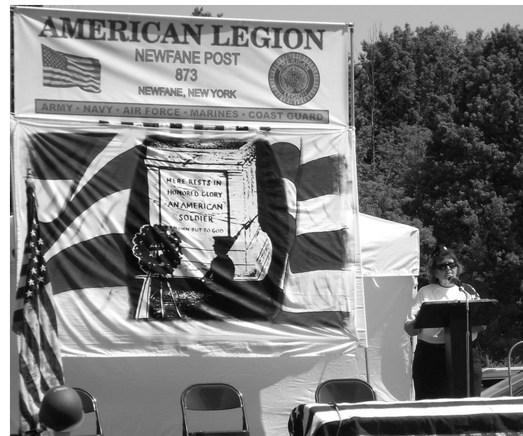
Memorial Day Observance

LEGION Act signed into law - Signed by President Trump in 2019, the law declares the U.S. has been in a state of war since Dec. 7, 1941. The declaration will honor 1,600 U.S. service members who were killed or wounded during previously undeclared periods of war – and The LEGION Act opens the door for approximately 6 million veterans to access additional programs and benefits. Use the contacts above to ask for more information about this law.