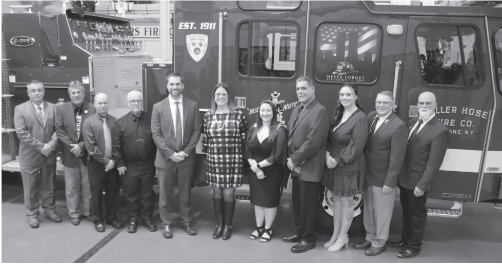
Trustees and Executive Board Members